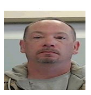
Offense Code CA12917086F4434