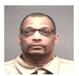
Charge/Offense Prior code: rape by force.

Lewd or lascivious acts with a child under 14 years of age.