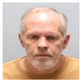
Offense Code CA48219273I6253