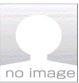
Roy Dale Hutchinson, 72 Location Details

Lewd or lascivious acts with a child under 14 years of age.