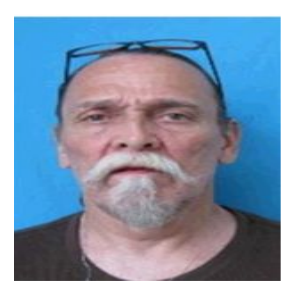
Charge/Offense Rape by force or fear.

Assault with intent to commit a specified sex offense.