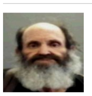
Charge/Offense Rape by force or fear.