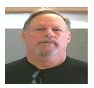
Charge/Offense Continuous sexual abuse of child.