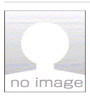
Charge/Offense Prior code: lewd or lascivious acts with a child under 14 years of age.