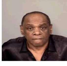
Charge/Offense Prior code: lewd or lascivious acts with a child under 14 years of age by force or fear.