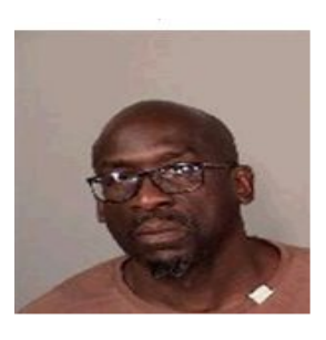
Charge/Offense Prior code: rape by force.

Lewd or lascivious acts with a child under 14 years of age.