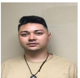
Offense Code CA18619176I3974