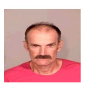
Charge/Offense Prior code: rape by force.