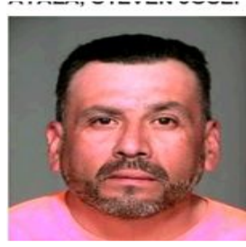
Charge/Offense Sodomy: person under 14.