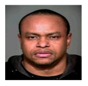
Charge/Offense Sodomy by use of force or injury.