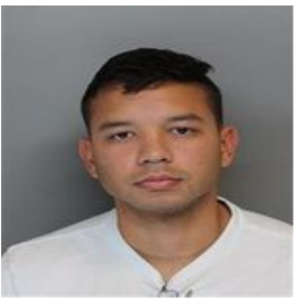
Offense Code SC2303958

Lewd or lascivious acts with a child under 14 years of age.