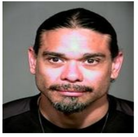
Location Details Transient, San Bernardino,