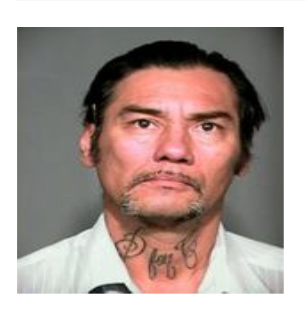
Charge/Offense Sexual battery.