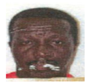
Charge/Offense Non-nys felony sex offense.

Charge/Offense Assault with intent to commit a specified sex offense.