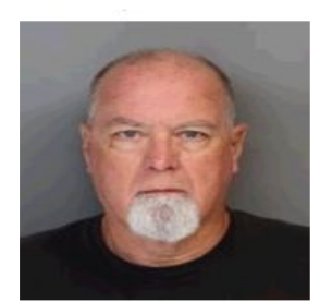
Charge/Offense Rape by force or fear.

Charge/Offense Oral copulation with a minor under 14 years of age or by force or fear.