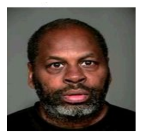
Charge/Offense Prior code: rape by force.