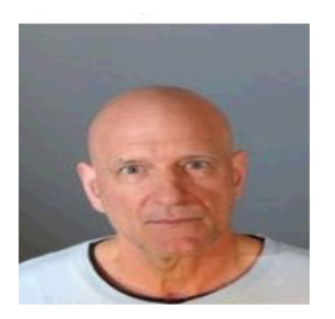
Charge/Offense Rape of a victim incapable of giving consent.

Charge/Offense Lewd or lascivious acts with a child under 14 years of age.