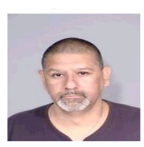
Charge/Offense Assault with intent to commit rape.