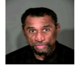
Charge/Offense Prior code: rape with force and threat.

Location Details 7465 Mountain Laurel Dr, Highland, CA 92346-3860