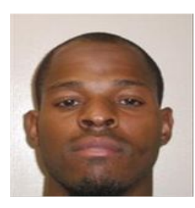
Offense Code CA18605326K2229

Possess or control obscene matter depicting minor in sexual conduct.