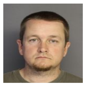
Charge/Offense Oral copulation of a person under 16.