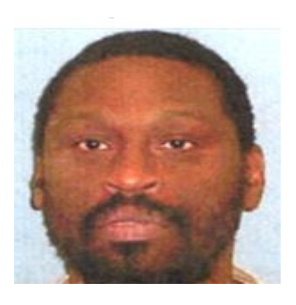
Charge/Offense Rape by force or fear.

Required to register based on a non-california sex offense.