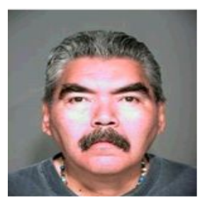
Charge/Offense Rape by force or fear.

Charge/Offense Annoy or molest child under 18 years of age.