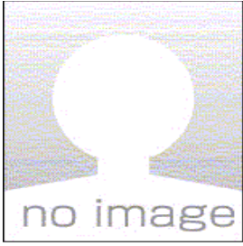
David Hilary Riehl, 40

Location Details 25101 Mammoth Cir, Lake Forest, CA 92630-2518