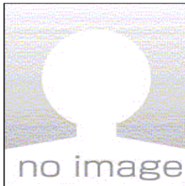
Yashar Behtoteh, 42

Location Details 99 Talisman Apt 332, Irvine, CA 92620-3851