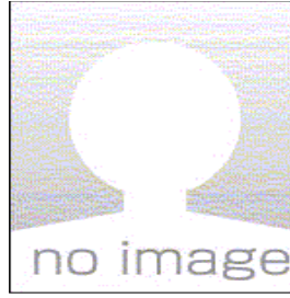
Habib Sesar, 73

Charge/Offense Contacting minor with intent to commit a specified sex offense.