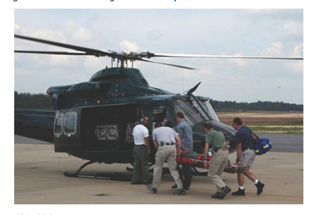
481 · 26 Comments

Take flight toward a new calling. #FBIJobs https://lnkd.in/e94R8H4